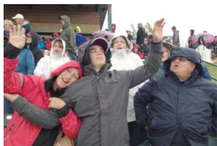
Dawgs Ballgame - June 15th

There was a note from Red Deer Club who have a camp every year in the second week in July.